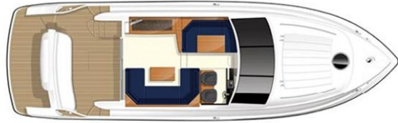
Manufacturer Provided Image: Main Deck Layout