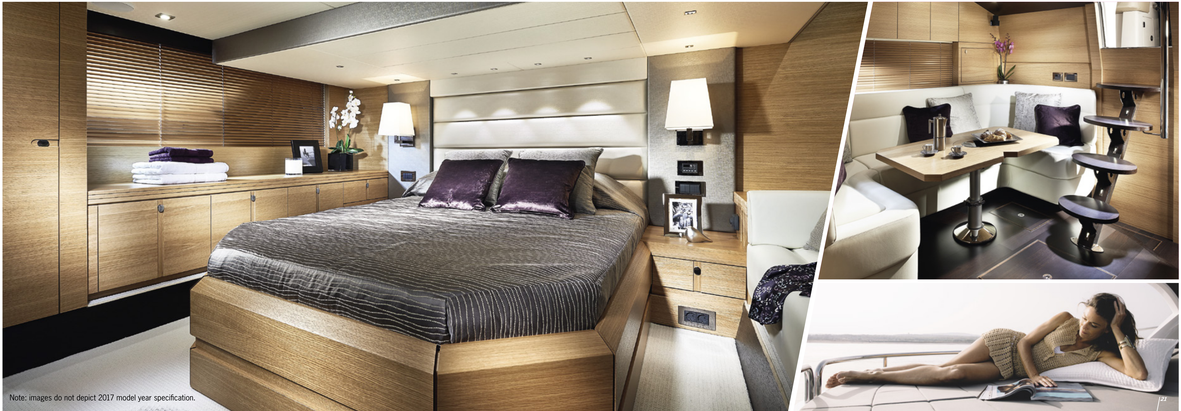
Note: images do not depict 2017 model year specification.